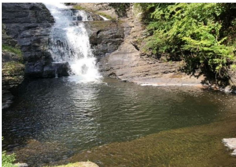
Swimming Hole at Hacker's Falls along Milford Knob Trail