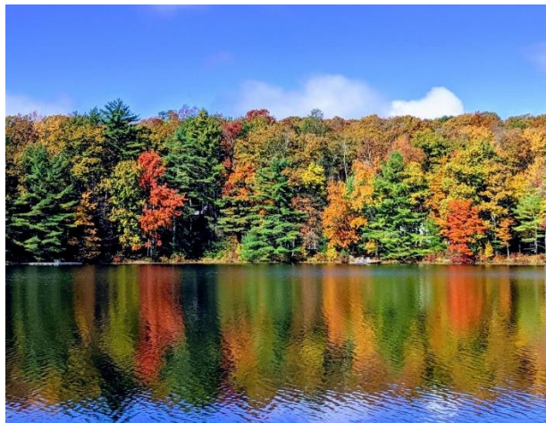
Autumn Colors at Walker Lake